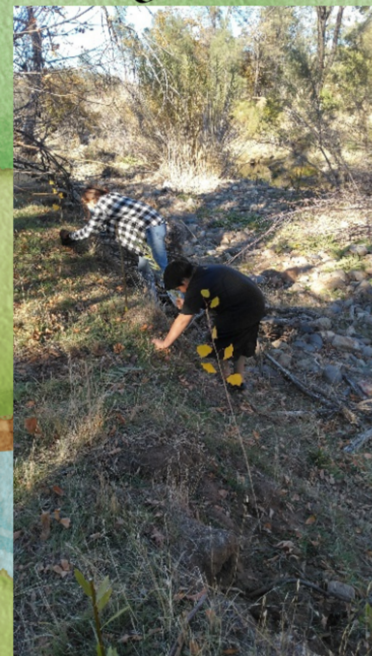
Planting cuttings in creek