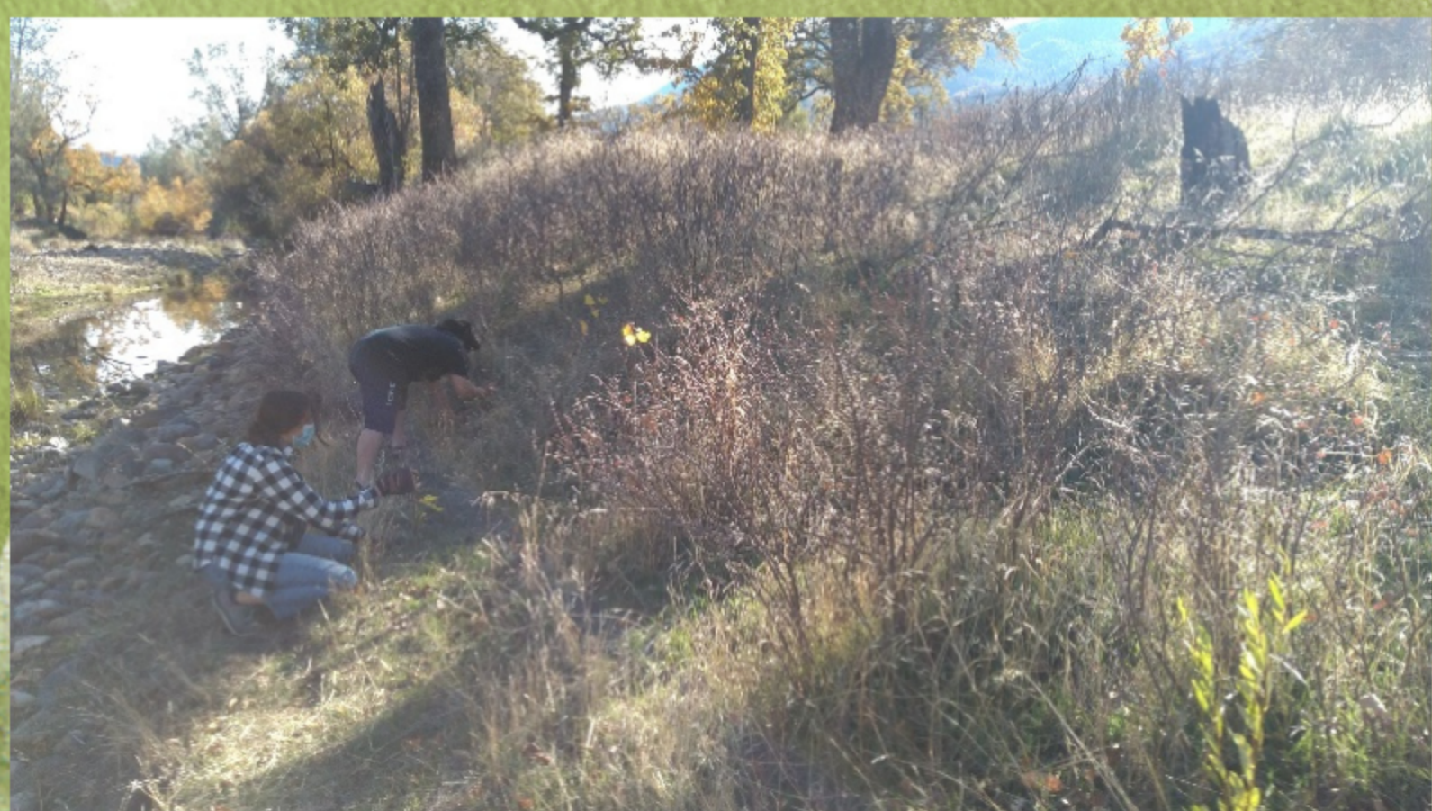
Planting and watering of willow and cottonwood cuttings