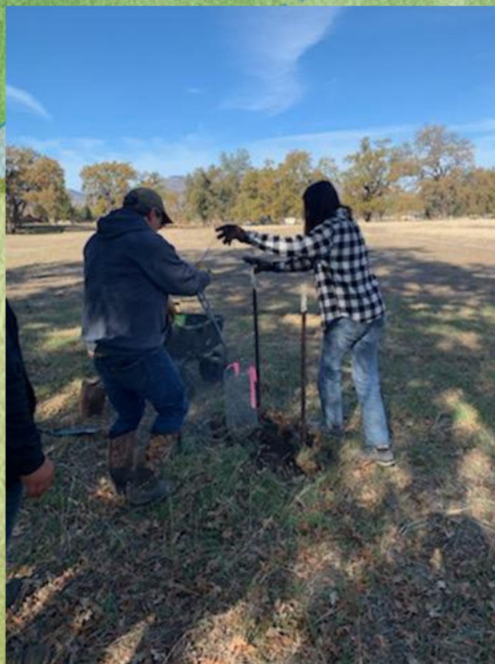
Replanting acorns for lost oak starts