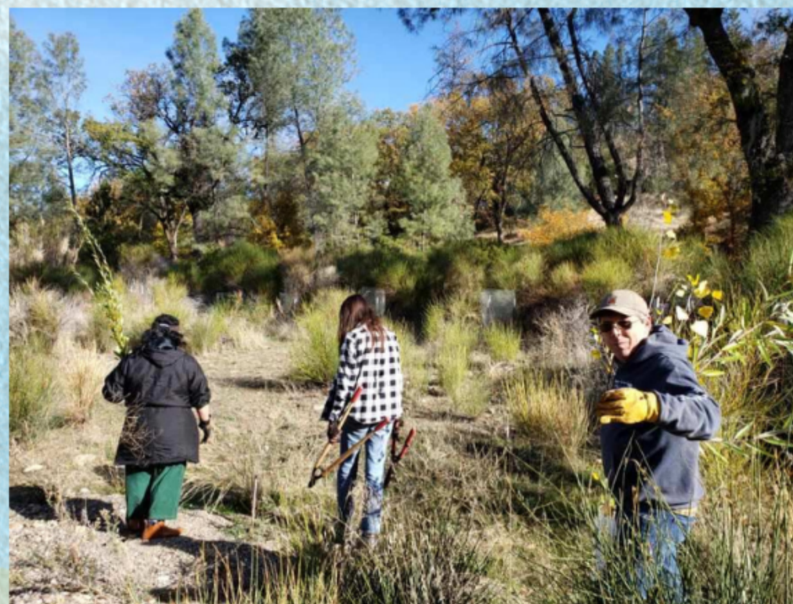
Creek collection of cuttings