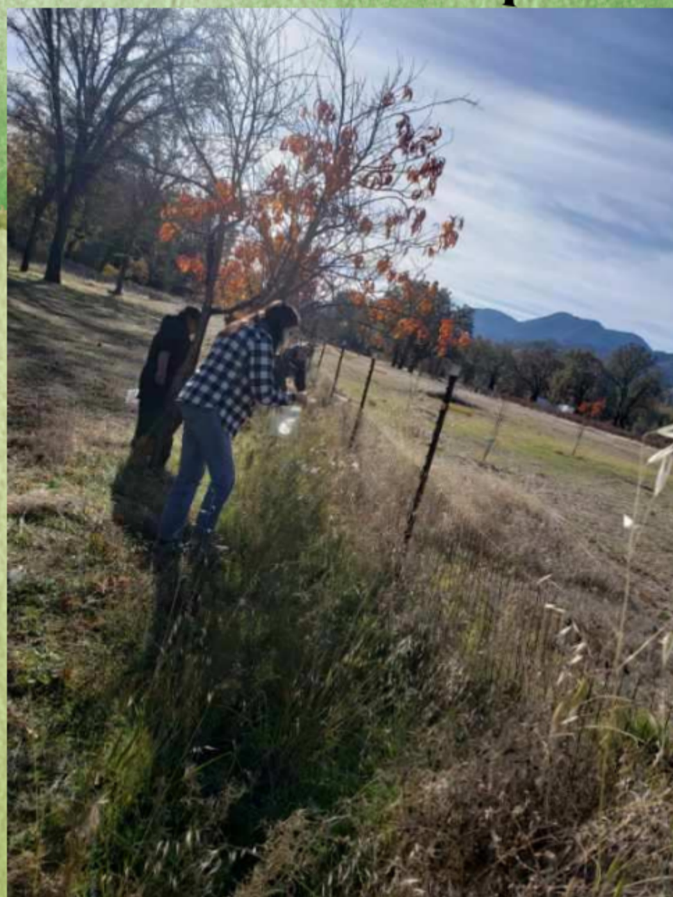
Milkweed garden collection