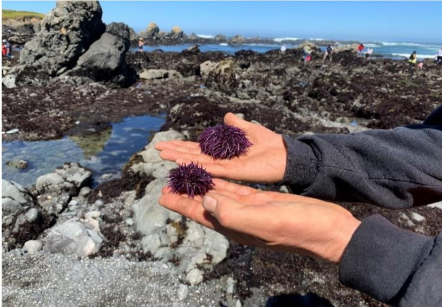
Kelp forest impacts by invasive Purple Sea Urchin explained.