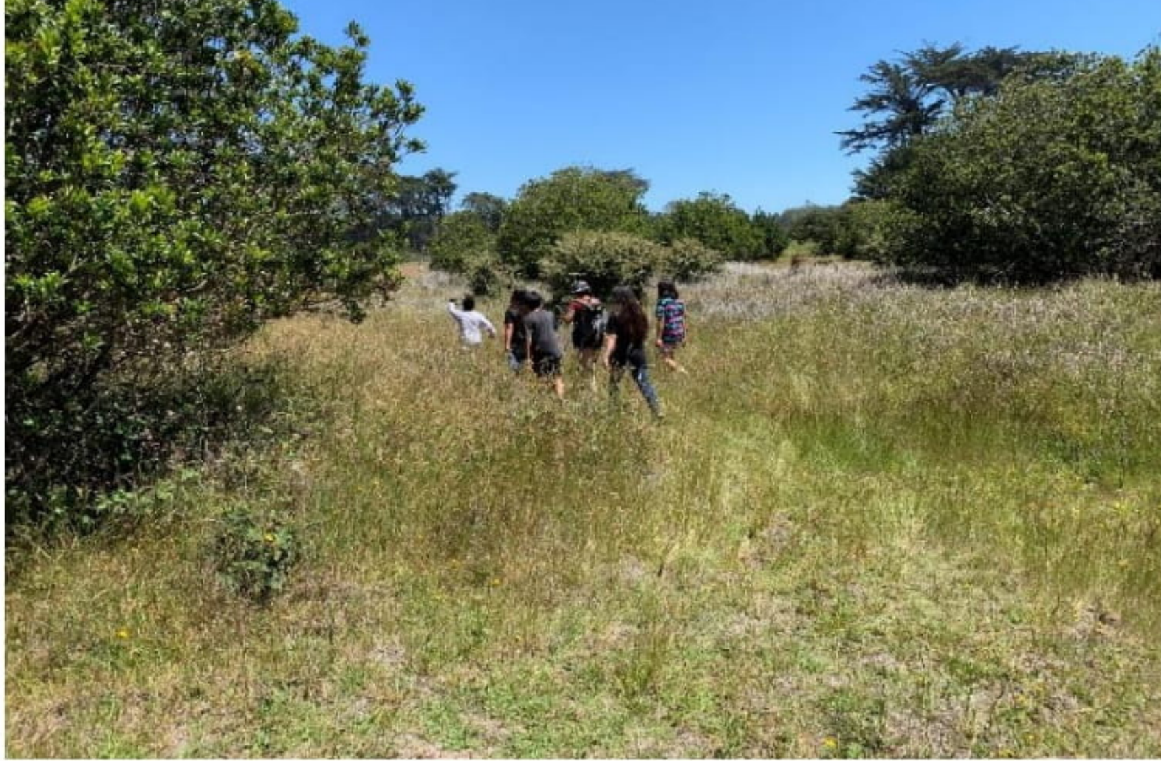
Tribal Youth searching for Geo-Caching site