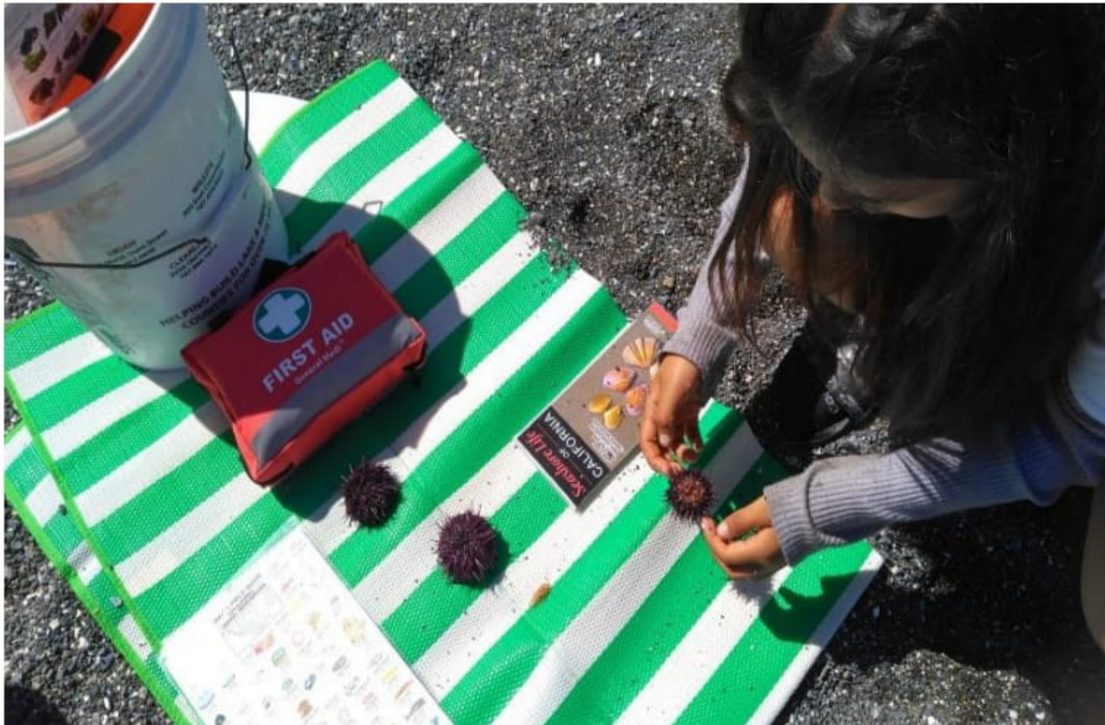
Tide Pool life ID cards were used by Youth/removed Urchin.