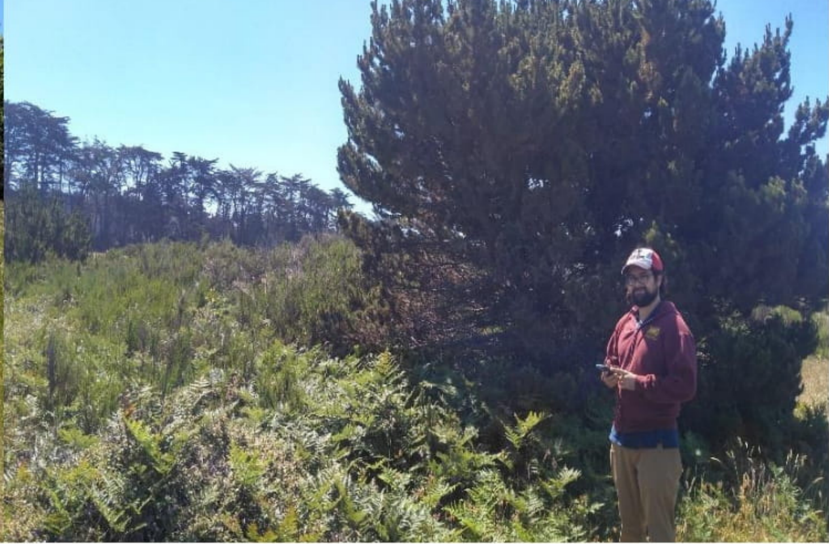
GIS data input for location in Coastal Terrace habitat