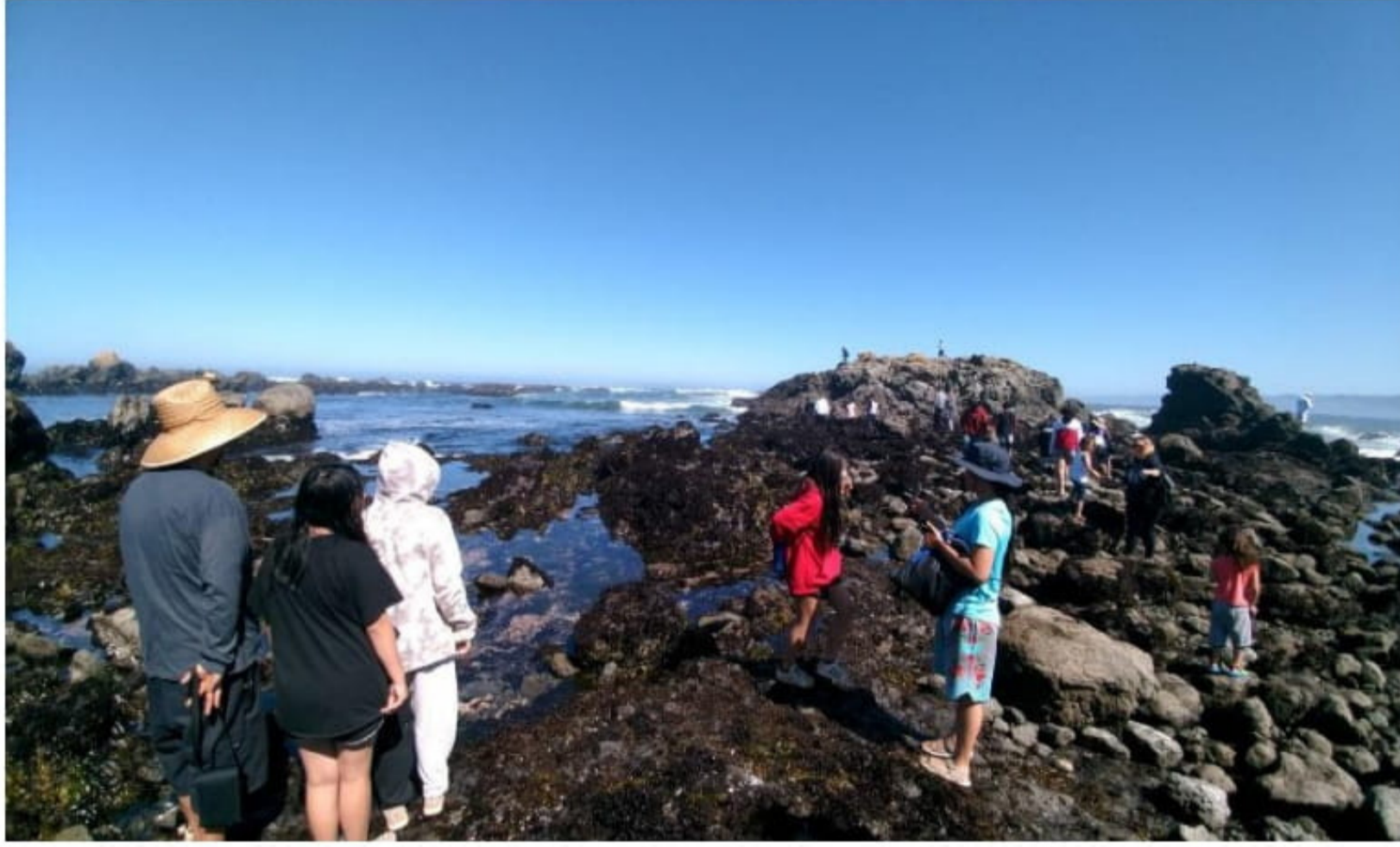
Tide Pool Field Trip during the lowest tide of the week.