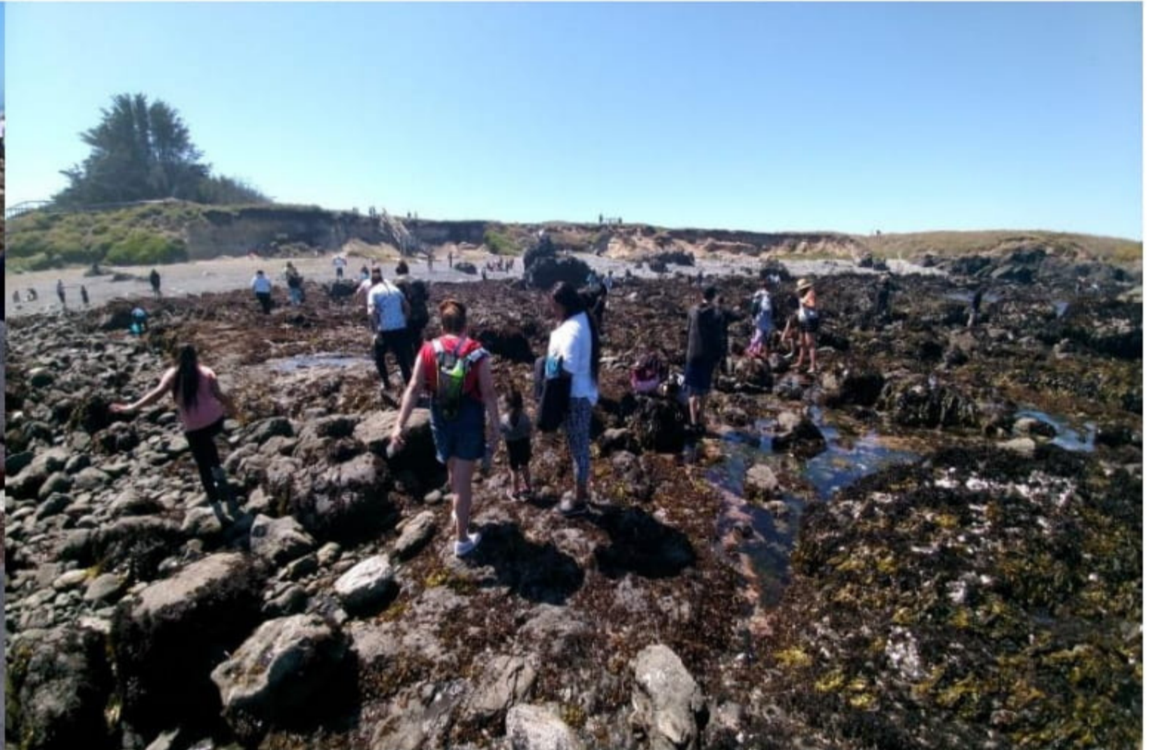
Attended by Over 75 Tribe Youth and 25 Adults