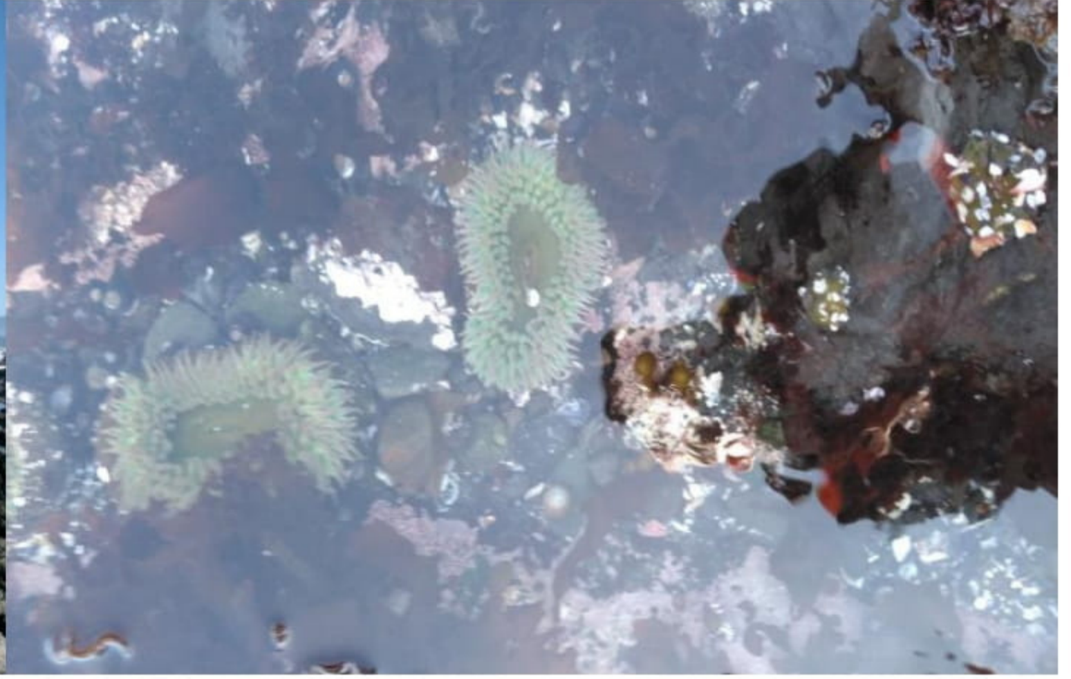
The Giant Green Sea Anemone of the North Coast.